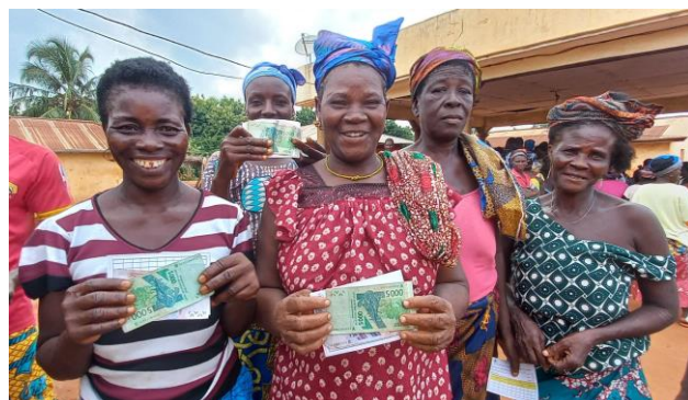
Beneficiaries of cash distribution operations on the site of Essè Godjin, Maritime region, southern Togo.

The WFP teams deployed in the field to oversee and monitor the operations conducted on-site questionnaires with the beneficiaries that confirmed the relevance of the targeting and their need for assistance.